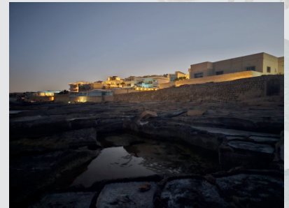
A City on a hill near St. Thomas Bay