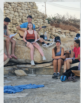
Worship at the sea