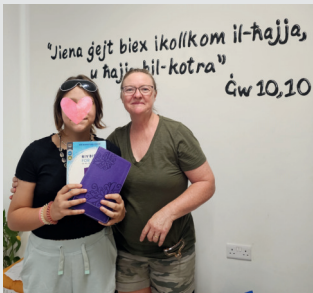
A young lady from camp that said "Yes" to Jesus.