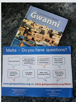
Gospel of John in Maltese and flyers