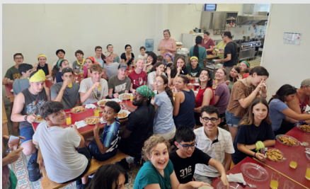
Feeding the multitude at camp