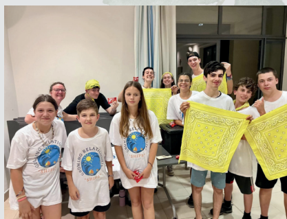
Yellow Lighthouses enjoying their camp win!