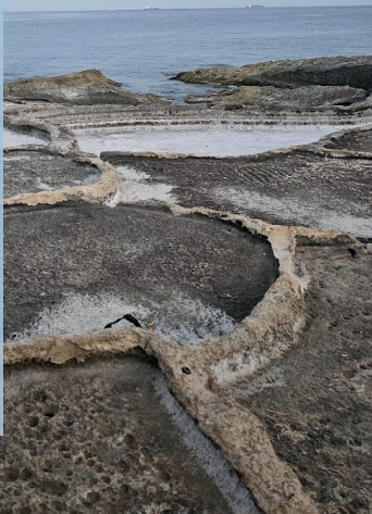
SALT PANS IN MARSASKALA