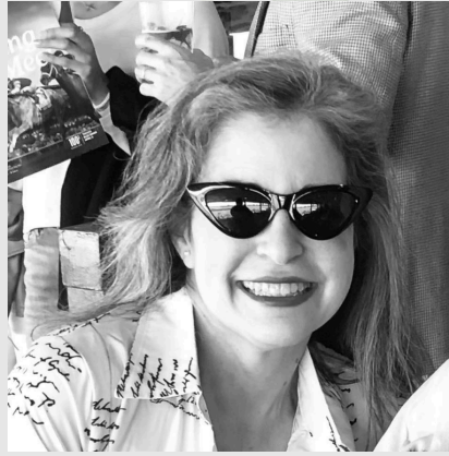
Alicia, The face behind Face Book